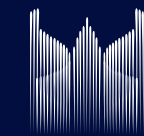
THE DUBAI FOUNTAIN

The spectacular neighbourhood of Arts and Culture